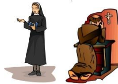
Nuns & monks