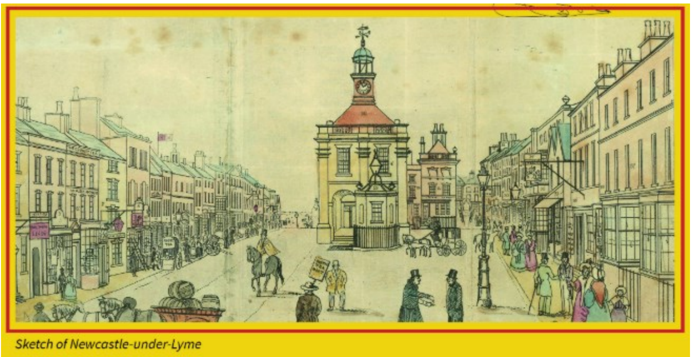
Sketch of Newcastle-under-Lyme

Philip Astley decided that a ring of ____feet across was a good size for a circus ring.