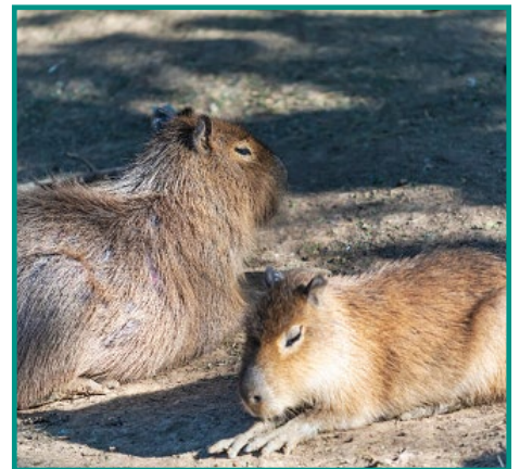
World's Largest Mouse Found and It's as Big as a Horse!