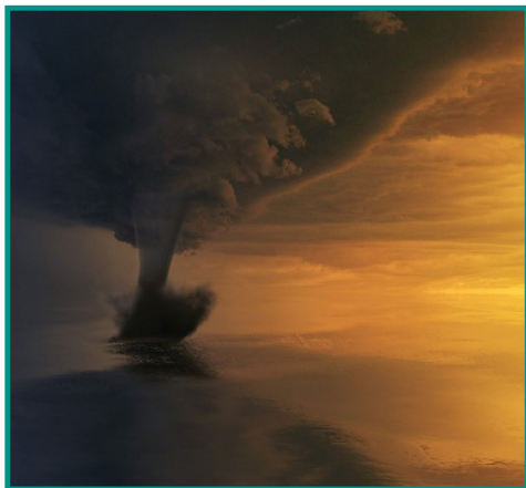
Tornado Hits South America